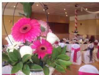
(Chair Covers with Sashes)