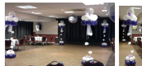
(Cloudnines arranged for corners of the dancefloor)