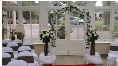
(Archway with Topiary Trees)