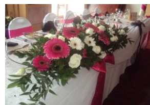
(Top Table Arrangement)